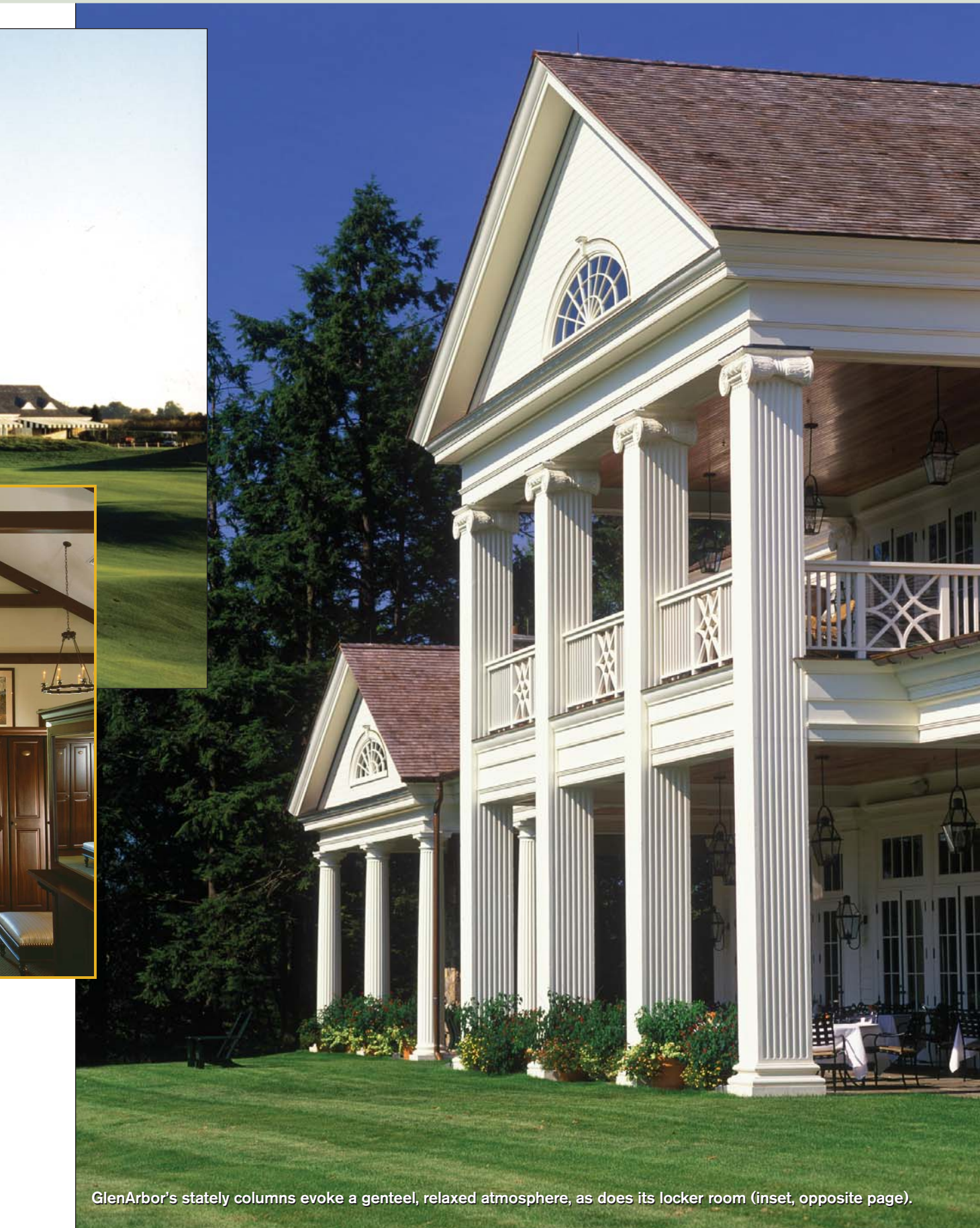
GlenArbor's stately columns evoke a genteel, relaxed atmosphere, as does its locker room (inset, opposite page).