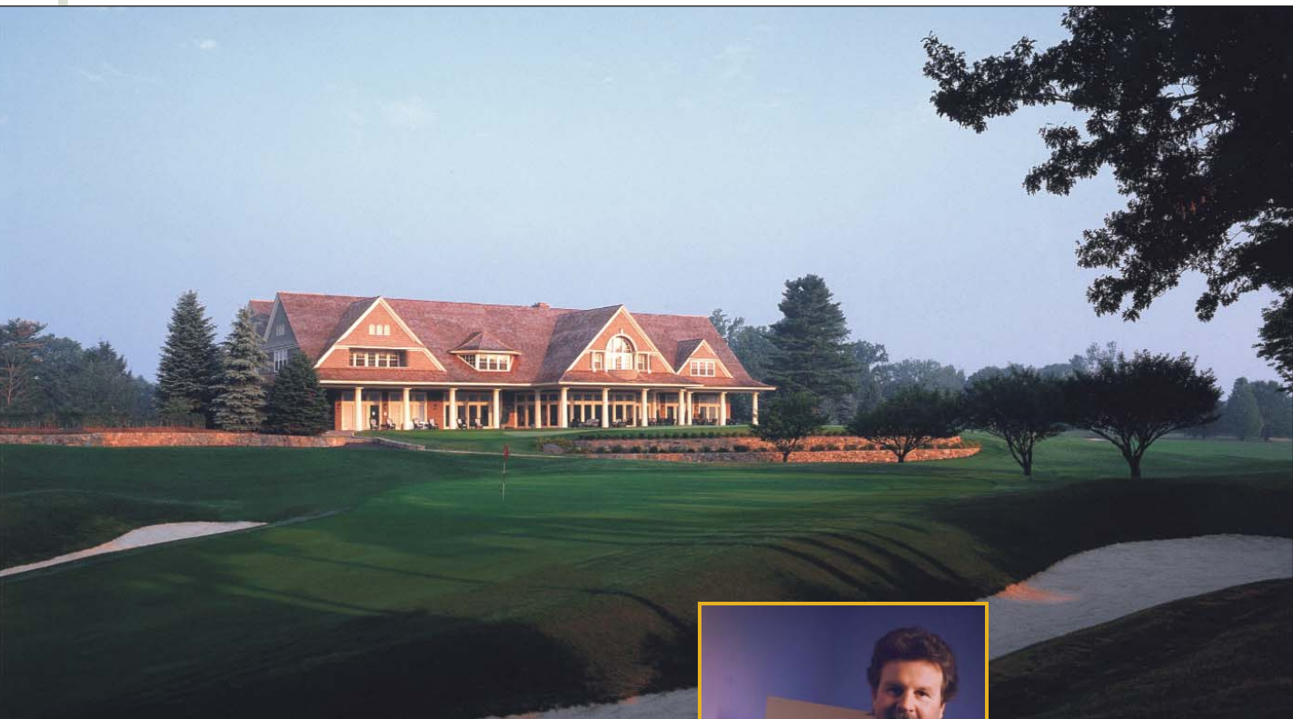
Mark Finlay (inset, right) designed Whippoorwill's clubhouse in the style of a large country cottage.

ly traditional or radically contemporary, these clubhouses relate to their courses much as the old-line clubs did (in some cases, better). In addition, they are often a lot more welcoming and casual in nature, with little or no fuss.