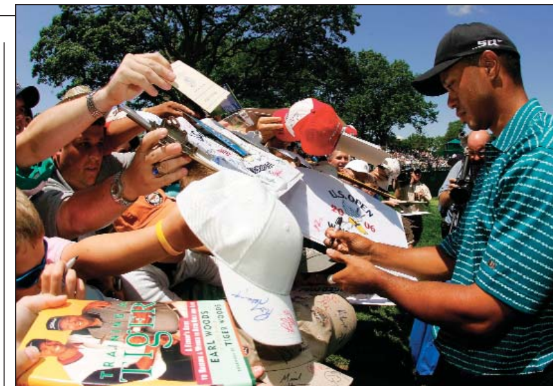
Tiger meets a fan at a 1994 junior clinic (far left) at St. Andrew's, and draws a considerably larger crowd at the 2006 U.S. Open.

When he came to town in late May of last year to play a practice round at Winged Foot, he also attended a New York Yankees game as a guest of his good friend Derek Jeter. The YES Network cameras showed him seemingly every few minutes - there's Tiger chatting on his cell phone, or eating a hot dog, or signing an autograph. While showing a celebrity at a baseball game is certainly not new, this particular instance displayed new heights of obsession with even his