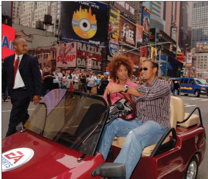
At a video game promotion in 2005, Tiger carted his way through Times Square.

49 Knollwood Road Elmsford, NY 10523 or visit our website at www.mgagolf.org