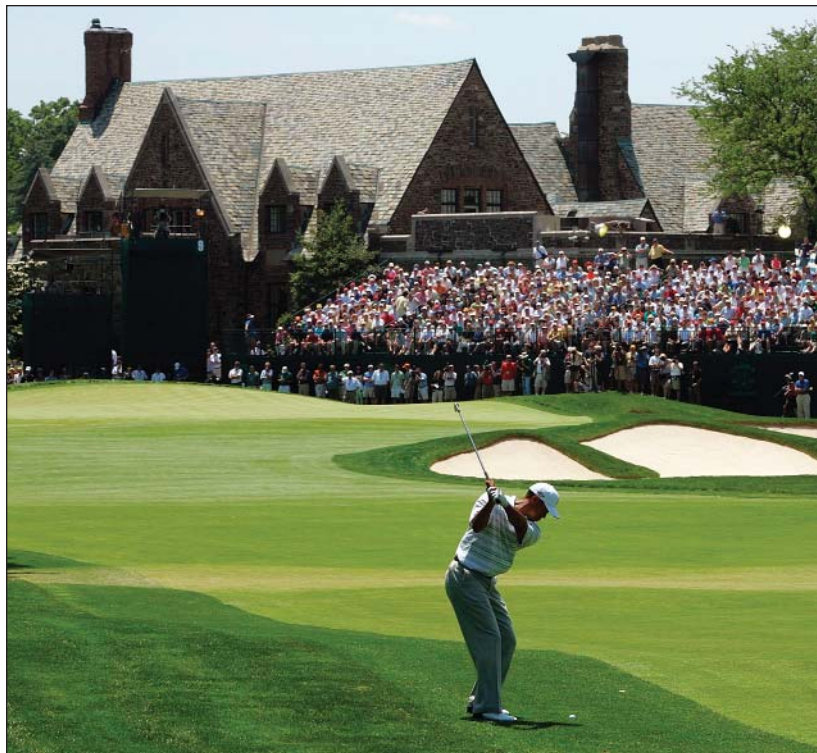
The crowds at Winged Foot witnessed a rare missed cut for Tiger.