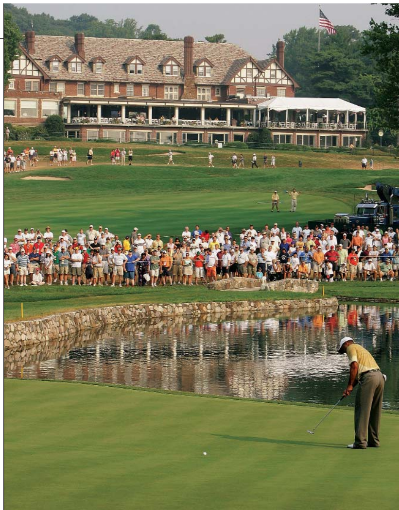
Above: Tiger contended at Baltusrol in the 2005 PGA but fell short of winning. After his father's death last year, the embrace between Tiger and Earl at the 1997 Masters (right) took on added meaning.