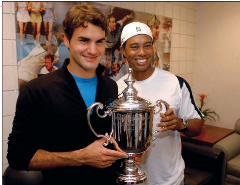
Above: Tiger was on hand at the U.S. Tennis Center in Queens to watch his pal Roger Federer win the 2006 U.S. Open. During golf's U.S. Open, Tiger's yacht (below) dwarfed others in Mamaroneck Harbor.

and only one other top-10 finish (the 2005 PGA Championship). For someone who has won at a 25-percent clip so far in his career (12 of 40 majors, 55 of 216 overall with 134 top-10s) his results here are merely mortal. In addition, they include these low points: