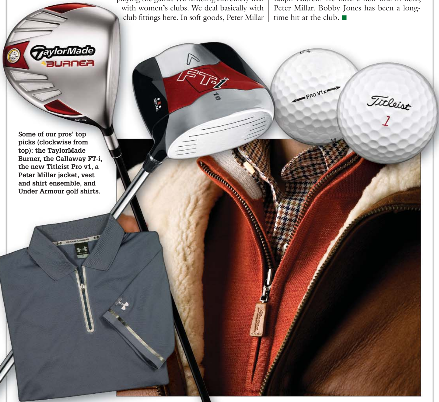
Some of our pros' top picks (clockwise from top): the TaylorMade Burner, the Callaway FT- i , the new Titleist Pro V1, a Peter Millar jacket, vest and shirt ensemble, and Under Armour golf shirts.