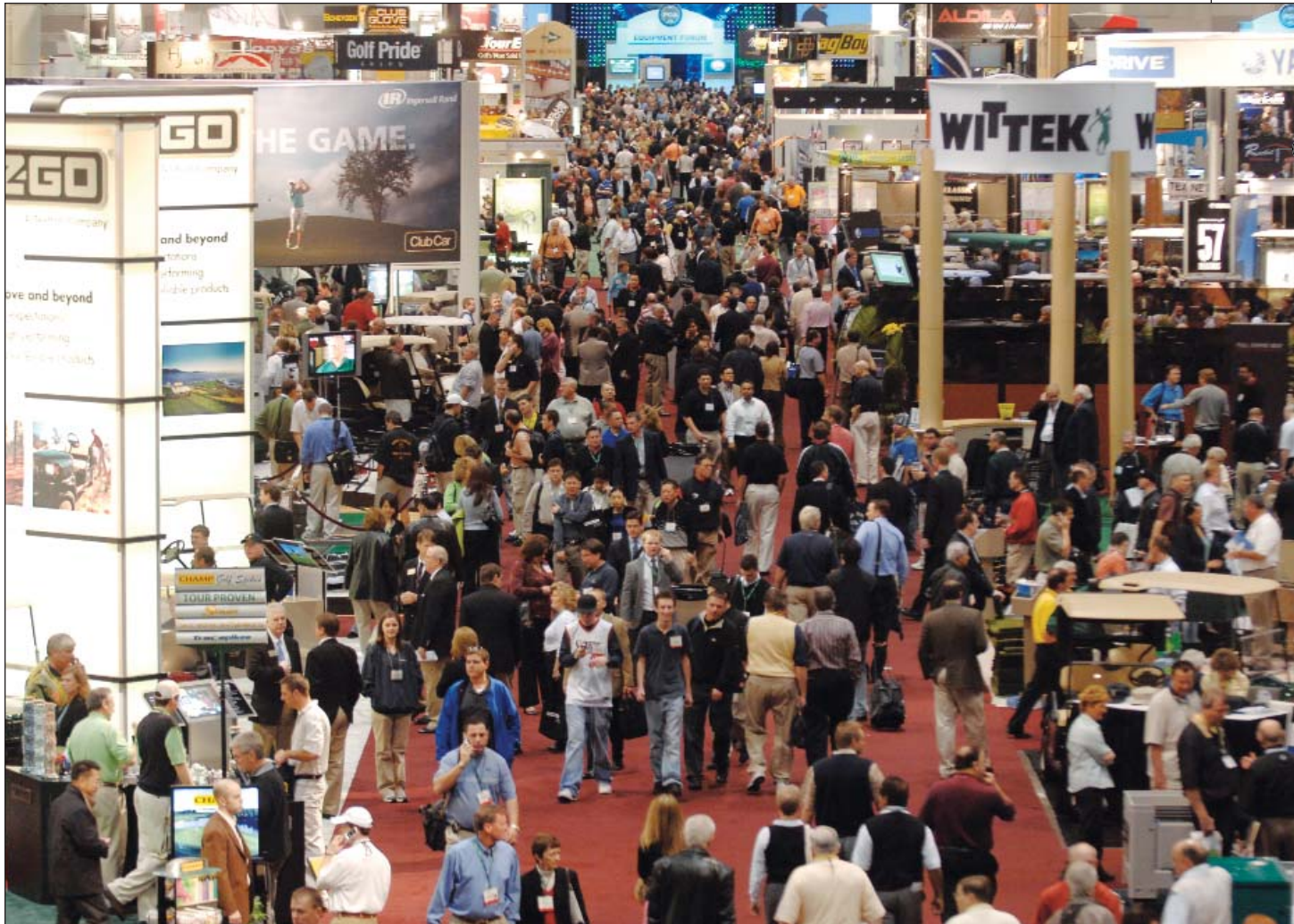
THE PGA OF AMERICA

The annual PGA Merchandise Show in Orlando is a prime opportunity for Met Area club pros to sample the latest equipment and apparel.