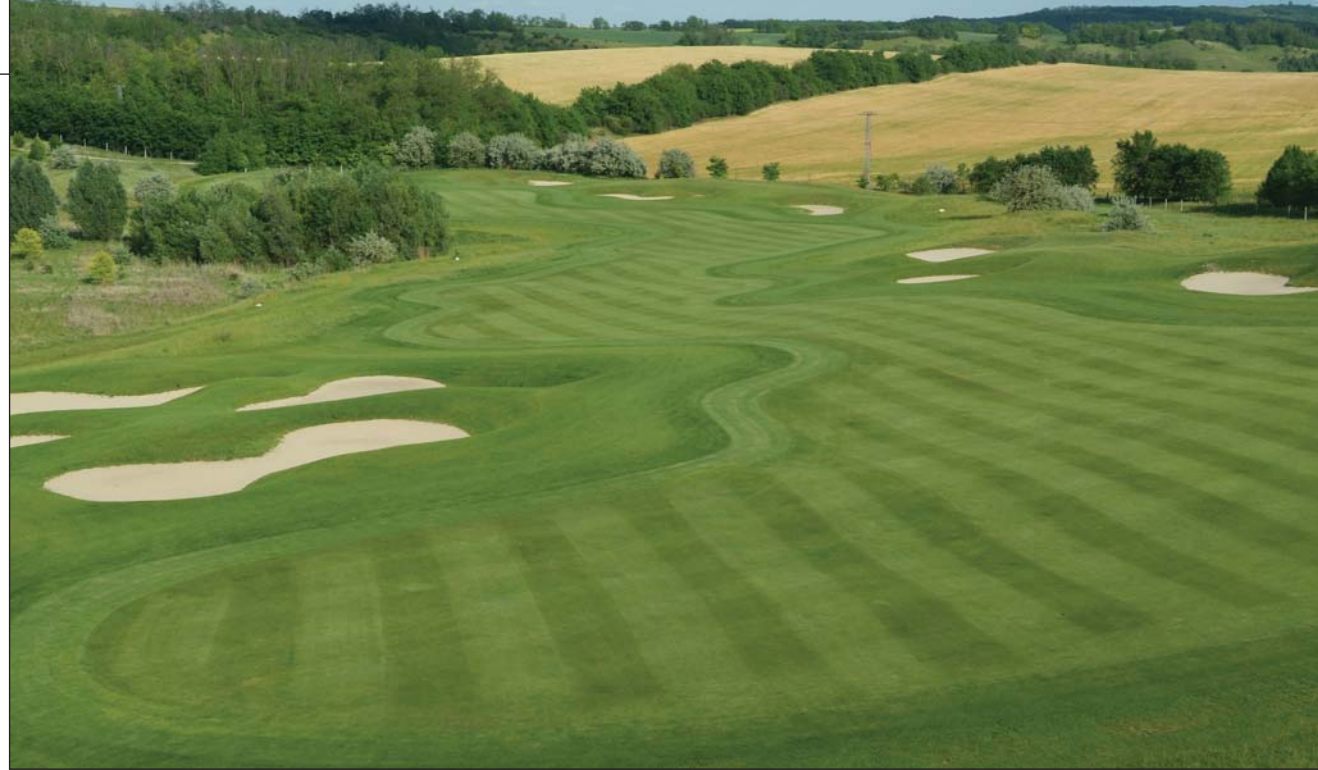
The outstanding Pannonia Golf Club (above) weaves links-like through the Hungarian countryside. Below: the imposing Melk Abbey is one of the most-visited sites in Austria.