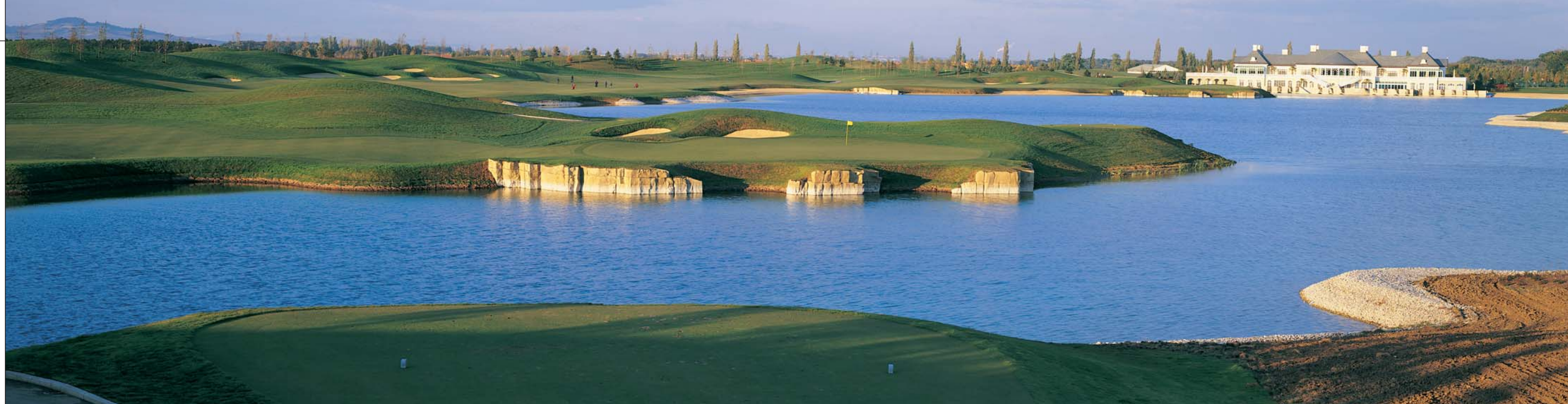
The modern amenities and course design at Fontana Golf Club contrast with the old-world charm of a Munich café (below).

and-destroy mission for any shop she had missed the day before, and I played the Golf Club Schofs Schonborn , regally nestled on the grounds of a 300-year old castle. On one hole you tee off in front of an Orangerie and take aim at a castle; on another hole you have to deal with a number of statues of long-dead members of various ruling families. I gave it