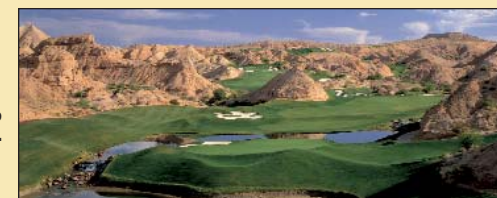
Right: Wolf Creek Golf Club Mesquite, Nev.