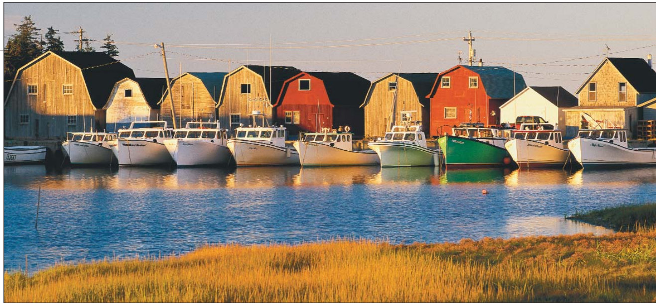
The quaint fishing village of Malpeque is one of many picturesque stops around the island.

sively wide fairways, difficult greens, and beautiful views of the Brudenell and Cardigan Rivers. But above all else, the Dunderave layout is characterized by its 121 bunkers, which are expertly positioned and filled with the reddish sand that is seen across many of P.E.I.'s beaches. Like Crowbush, it also was the site for a Legends of Golf event between Tom Watson and Jack Nicklaus in 2006.