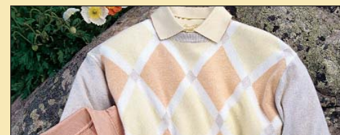
Left: Ben Hogan Apparel Denver, Colo.